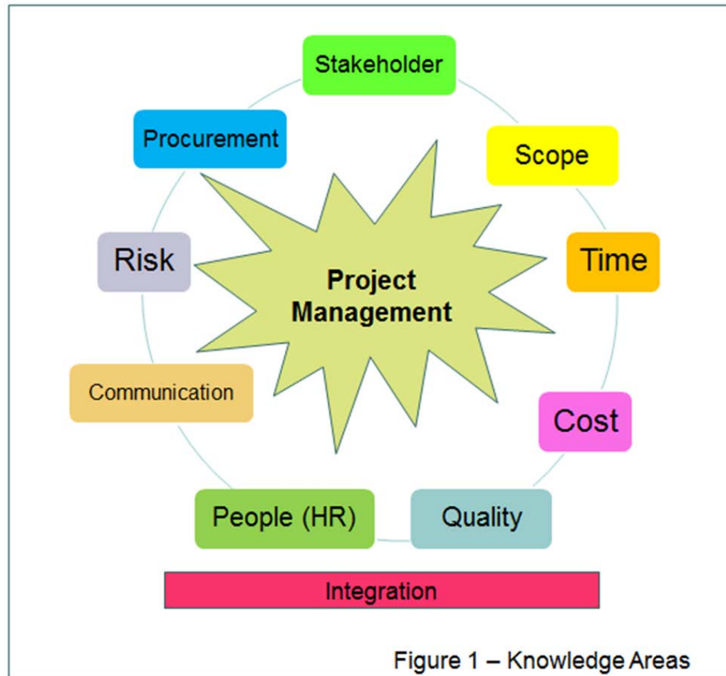
Figure 1 – Knowledge Areas